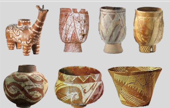
White-painted pottery: vessels and fragments

The focus is on the regions and schools with highest percentage of students from ethnic minorities and vulnerable children.