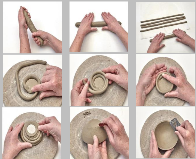
Coiling technique: shaping the vessels

Moreover, it reveals a variability of decorative styles, characteristic of various groups of population that shared not only common territories, but also similar aesthetic views expressed in material culture, such as pottery and its decoration.