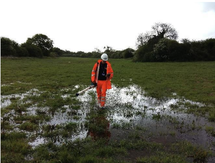
Figure 1 EM survey in progress over the flooded southwestern half of the Copthall North site

The ERT data was more successful than the EM survey. The features detected using this method appear to be in-channel and bank features made of coarser sediments such as gravels. These features are potential locations of the foci of prehistoric activity on the floodplains and these surveys have enabled us to identify locations for further intrusive investigations along the Newyears Bourne (Figure 2).