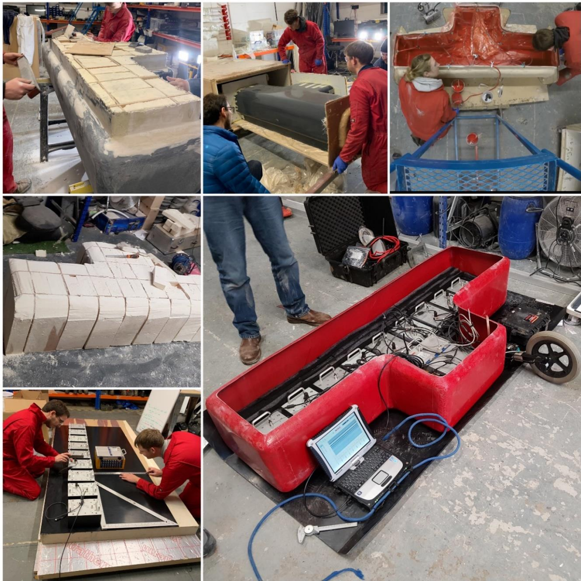
Figure 3.3 The stages of building a bespoke 3D GPR system, starting from the bottom left and moving clockwise: measuring the GPR array to determine the size of the case; assembling a form from CNC-milled MDF and foam; finishing the form surface with polishable primer and resin; curing the first stages of a multi-part mould onto the form using a temperature-controlled cupboard; vacuum infusing resin through the final part in its mould; finished component undergoing initial testing