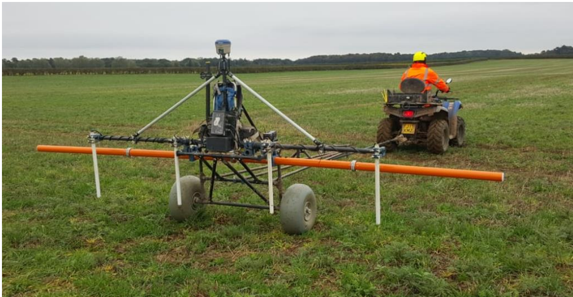
Figure 3.1 Modular cart system simultaneously collecting magnetometer and electromagnetic conductivity data

could be adaptable to different survey environments and requirements, so we purchased an off-the-shelf 3D GPR system that contained nine individual antennas. These costly systems are normally used in utility surveys for their high resolution, but they have been used in archaeology mainly by research institutes (e.g. the Stonehenge Hidden Landscape Project). One of our live research and development projects is reverse engineering this multi-channel system into a more lightweight case and carrier that will be better suited to greenfield sites, with adjustable channel spacings to suit different resolution needs. We also aim to build on our experience in automating our magnetometer processing, applying the same principles to GPR data. Optimising our radar data collection and processing workflows will reduce our turnaround time for GPR surveys and in turn decrease deployment cost, making large-scale surveys a more viable option for commercial projects (Figure 3.3).