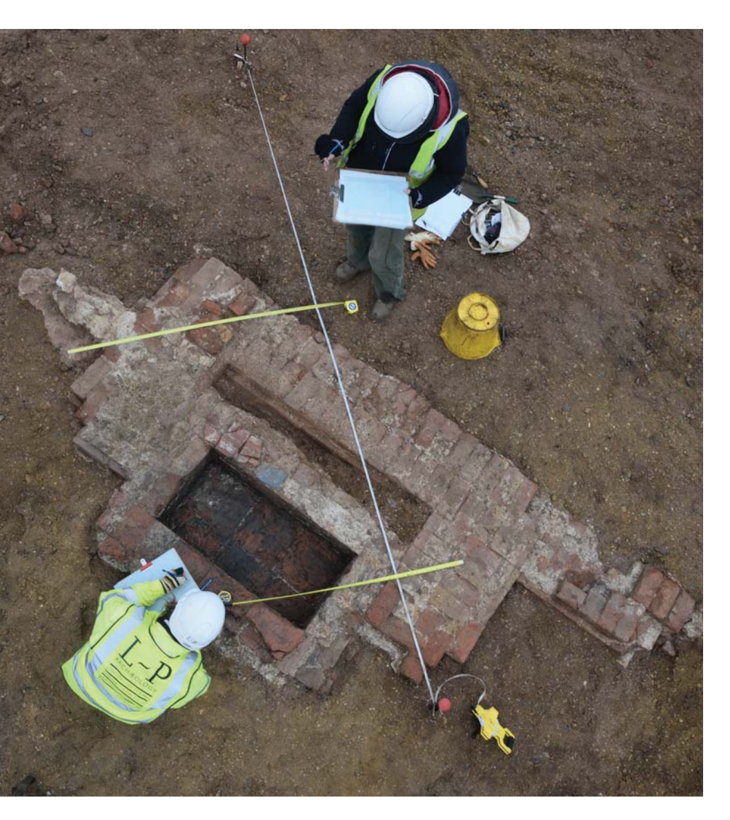
L-P : Archaeology excavation in London.

Each year the Registration committee (Organisations) reviews the policies, procedures and standards of the organisations applying for registration. This review also looks at how these policies, procedures and standards are implemented across the organisations. Inspection panels take the time to discuss in detail with Responsible Postholders how organisations operate and how they comply with the requirements of the Registered Organisations scheme and ClfA standards and guidance. A focus of the inspection is examination of one or more projects from inception to completion, complemented by discussion with the organisation's leaders. The panel will also speak with staff members, both in the office and on site, to discuss their roles within the organisation, their understanding of the project, training opportunities open to them, and how they are made aware of, and have access to, this information.