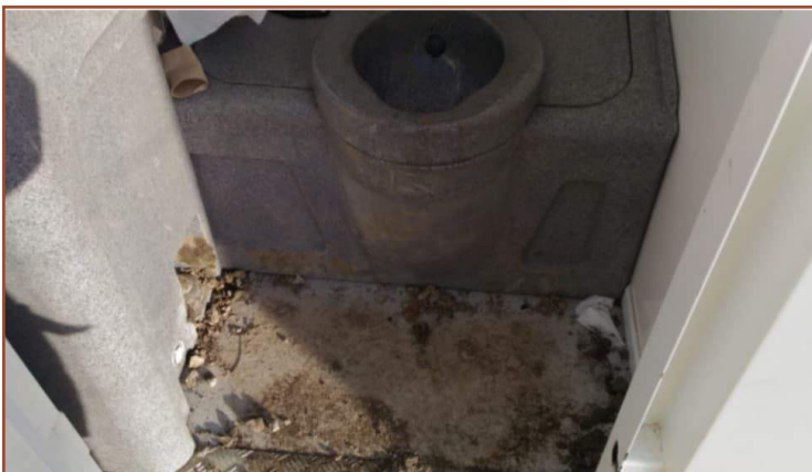
Example of poor welfare facilities

Regarding female specific toilets, there have been, and still are, multiple times reported (Source: MWAH! Facebook discussion group, comprised of cross-disciplinary women) where the female toilet has been locked on site without accessible keys, or does not contain hand soap, or even gets cleaned and emptied less regularly than the specific 'For Men' toilets. While many sites will use unisex toilets, it does appear to be a regular problem on construction sites, that despite ticking a box to have a female specific toilet, it is not maintained to the same standard. MWAH! would like to have more awareness on these sites for women to be able always access a clean, hygienic toilet. This is imperative for any menstruating individuals and those going through the menopause.