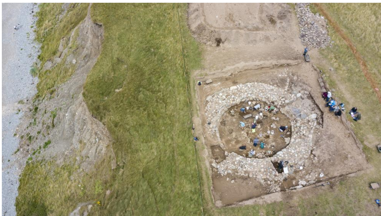
Local volunteers carrying out excavations to save their heritage at the hillfort at Dinas Dinlle, Gwynedd.