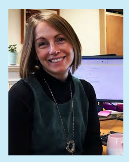
Catherine Bell Advisor

A building near where I live that I return to on a regular basis, and show to visitors new to the area, is St Mary's Church in Deerhurst. Not only is it one of the most complete Saxon churches surviving in England, incredibly dating from the 8th century before the first Viking raids and with some wonderful works of sculpture. With its tall tower it stands sentinel-like along the east bank of the Severn. It also makes one think and wonder about our ever-changing landscape — there are Romano-British burials beneath and around it, it sits within a monastic precinct which includes a farmhouse adapted from the remains of the 14th century cloister and to the south east are the remains of a shrunken medieval settlement — probably dating from after the foundation of the church and before the dedication of Odda's Chapel in 1056.