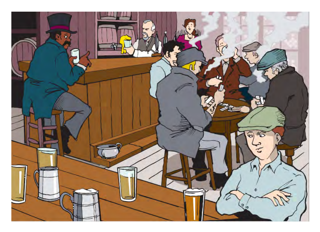
Figure 1 Comic book image