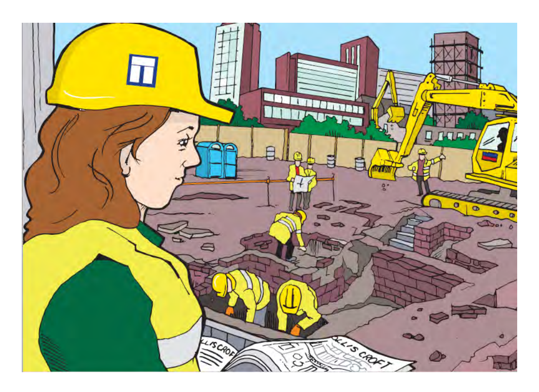
Figure 2 Comic book image