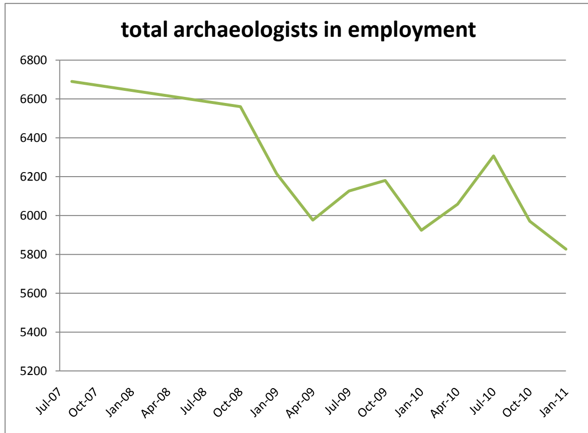
Employment in UK archaeology, August 2007 – January 2011